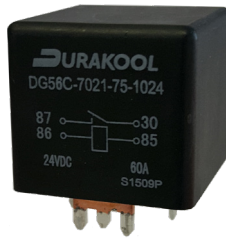
PCB version pictured